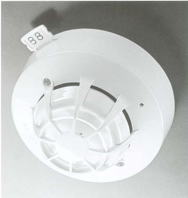
XP95 Multisensor Detector